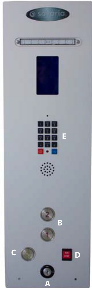
Figure 1: Sample COP